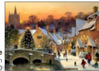
Castle Combe, Wiltshire Size 160mm x 116mm Price per pack of 10 cards £3.50