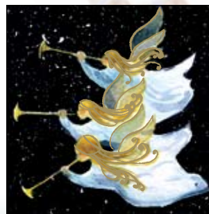
Angels Gold Foil Size 140mm x 140mm Price per pack of 10 cards £3.95