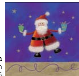
Jolly Santa Size 108mm x 108mm Price per pack of 10 cards £2.75