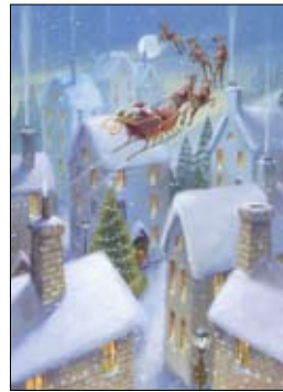
Christmas Delivery Size 116mm x 160mm Price per pack of 10 cards £3.50