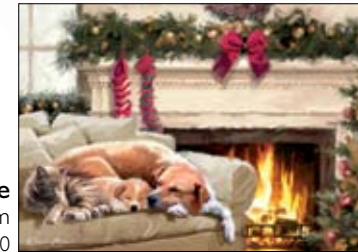
By the Fireside Size 160mm x 116mm Price per pack of 10 cards £3.50