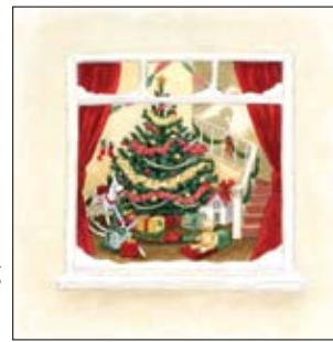
Christmas Morning Size 140mm x 140mm Price per pack of 10 cards £3.25

With Best Wishes for Christmas and the New Year