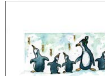
Fish Supper Size 160mm x 116mm Price per pack of 10 cards £3.25