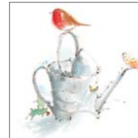
Robin on a Watering Can Size 108mm x 108mm Price per pack of 10 cards £2.75